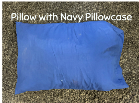
Pillow with Navy Pillowcase