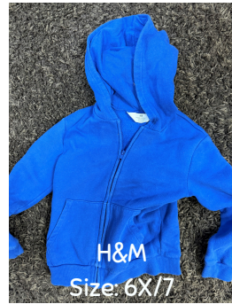
H&M Size: 6X/7