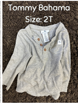
Tommy Bahama Size: 2T