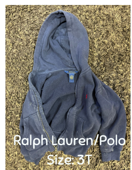
Ralph Lauren/Polo Size: 3T