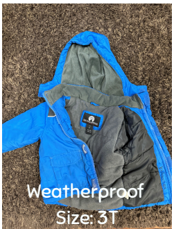
Weatherproof Size: 3T