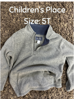
Children's Place Size: 5T