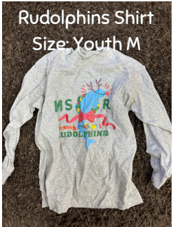
Rudolphs Shirt Size: Youth M