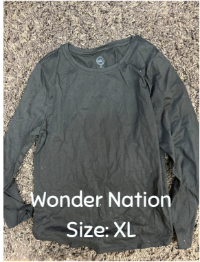
Wonder Nation Size: XL

Any items not claimed by Friday, May 24th will be donated!