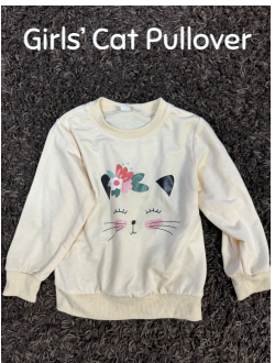
Girls' Cat Pullover