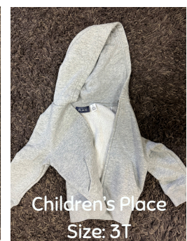
Children's Place Size: 3T