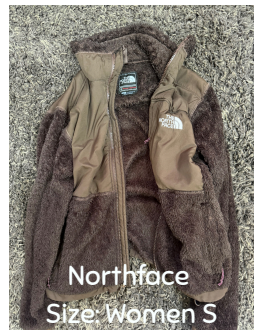
Northface Size: Women S