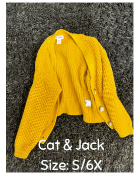
Cat & Jack Size: 5/6X