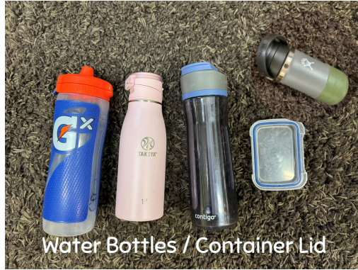
Water Bottles / Container Lid