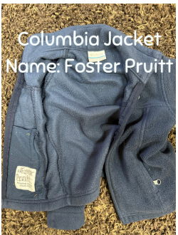
Columbia Jacket Name: Foster Pruitt